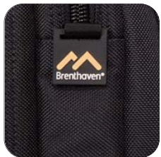
Rugged Ballistic Nylon

Legendary protection and craftsmanship are now coupled with a smooth ride. This two compartment case contains the patent-pending CORE Protection System, a unique computer compartment that cradles your notebook. Our patented SoftDrive™ system protects against damage that can occur from jarring and vibration.