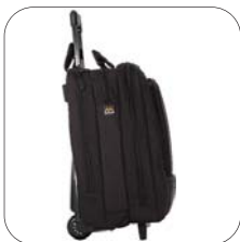
Slim & Sleek design with ergonomic handles