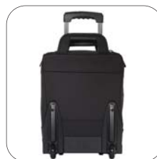
Back Wheelie Strap